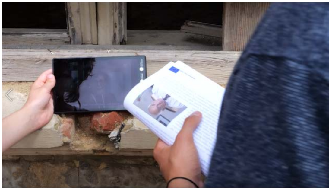
The testimony activities in the site of Schindler's Ark alongside original places

The activity completed the following steps, an educator introduced the activity and guided through the testimony and exercises based on Schindler's Ark: