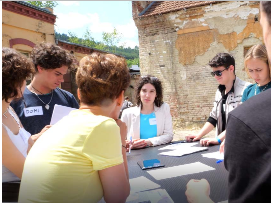
In person group teaching based on the digital and place-based testimony activities