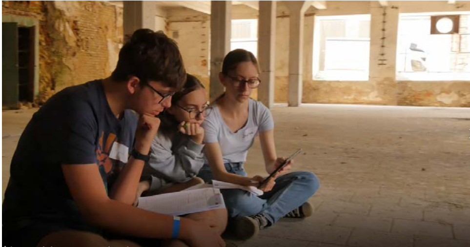
Experiencing the testimonies of survivors in the place where the events occurred